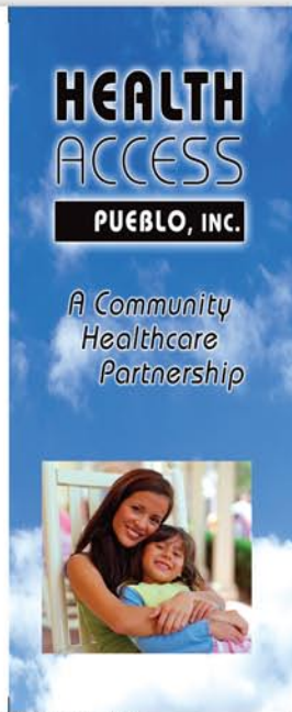
Bi-fold Brochure 8.5" x 11"